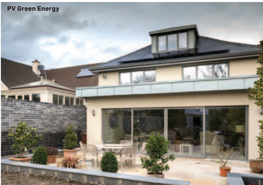
PV Green Energy

Home Show. Revenue.ie and the Construction Industry Federation will be on hand to offer advice on tax breaks, grants and how to find reliable builders and contractors.