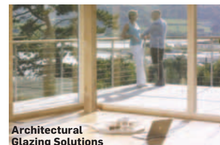
Architectural Glazing Solutions

Contemporary Nordic style merges with Parisian chic at the Spring Ideal Home Show's Garden Room Extension Showhouse writes Meghan O'Dowd